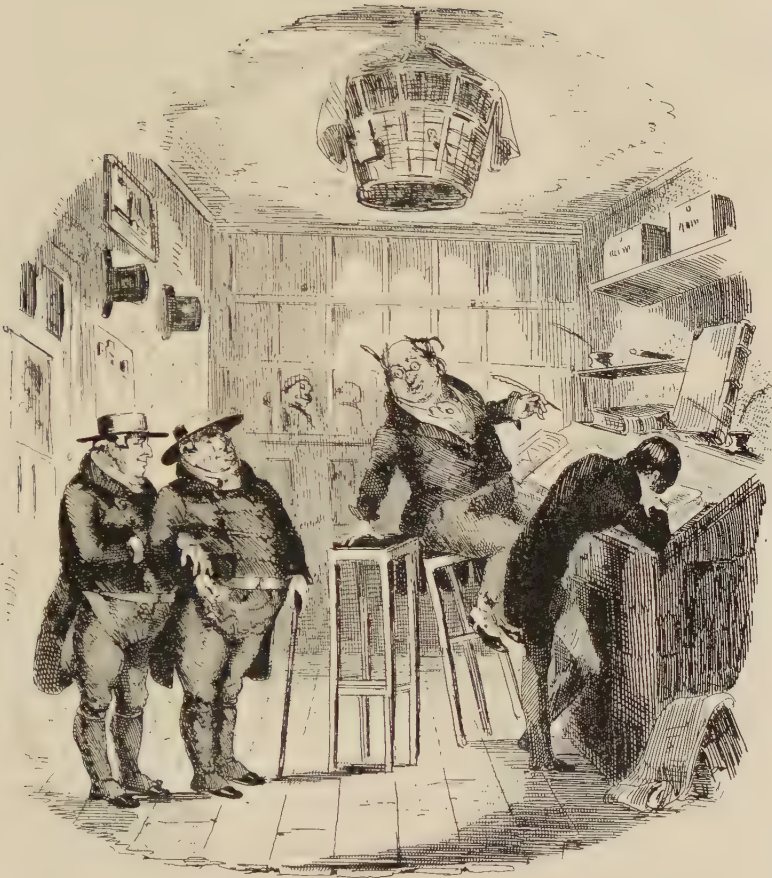
MR. LINKINWATER INTIMATES HIS APPROVAL OF NICHOLAS.